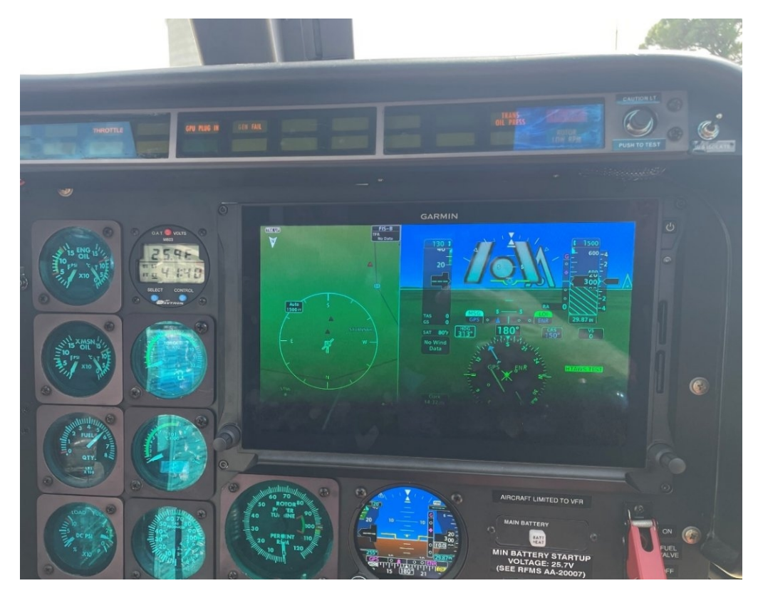
Figure 2 - Exemplar of instrument panel as configured in accident helicopter.

The wreckage was examined at the accident site on and all major components of the helicopter were accounted for at the scene. The fuselage came to rest on its left side about 670 ft beyond the base of the tower on an approximate azimuth of 220° and was destroyed by impact and fire. The tailboom remained attached but was deformed by impact and fire. The tailrotor and tailrotor gearbox were separated from the airframe as a unit and found entangled in the wreckage. One blade was separated from its grip and damaged by fire.